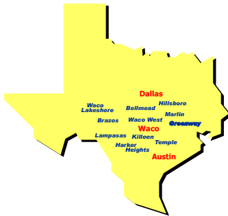
Central Texas Nephrology Associates – Waco Area